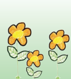
California Golden Poppy

The sand dunes serve as a nesting area for birds, as well as protecting the beach from erosion. Development of the shoreline as beachfront property and unaware visitors trampling sensitive dunes are causing massive erosion.